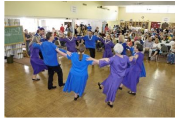
Israeli Dancers, Yiddish Food Festival, May 2009