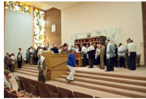
Participants in Main Sanctuary, Centennial Celebration, June 2010

The earliest Jewish pioneers and settlers in Wyoming were immigrants from Europe seeking religious freedom. German Jewish merchants came to Cheyenne in 1867. By 1888, the congregation, Temple Emanuel, was formed.