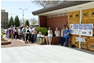
Eager Attendees Waiting for Yiddish Food Festival to Begin, May 2009