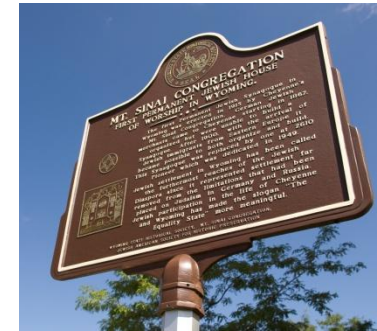
Historic Marker at Pioneer Avenue and 20th Street

2610 Pioneer Avenue Cheyenne, Wyoming 82001