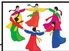
2 Israeli Folk Dancing Shows

11 am: Doors Open & Blowing of the Shofar